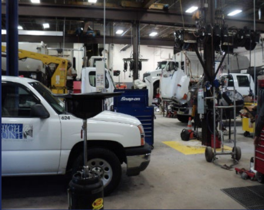
18 Work Bays