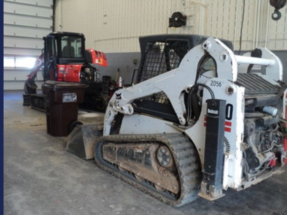
Off Road / Construction