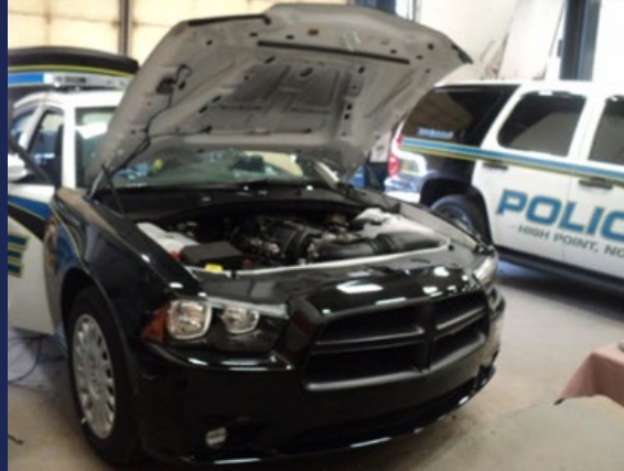
Full Police Equipment Installation