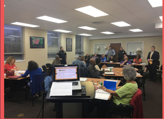
First day of Kinston 101 in 2021

Citizens academies are educational programs conducted by cities and counties aiming to create better informed and engaged citizens.