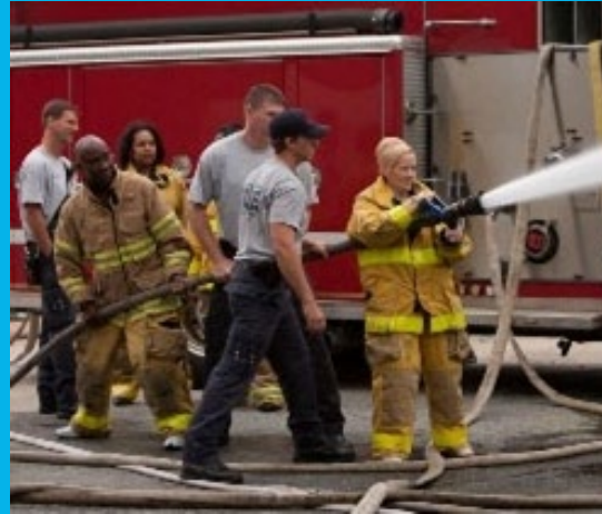
A demonstration in Greensboro's City Academy