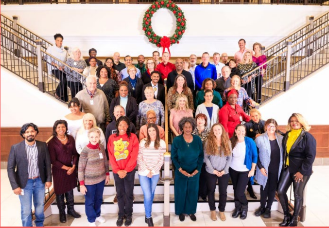
Concord 101 Class of 2023