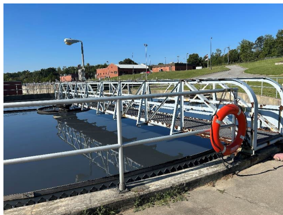
Example of a Primary Clarifier Bridge

RECOMMENDATION/ACTION REQUESTED: The Public Services Department recommends approval of the contract, and that the appropriate City Official(s) be authorized to execute all necessary documents to award the project to Jimmy R. Lynch and Sons Inc. in the amount of $536,000.