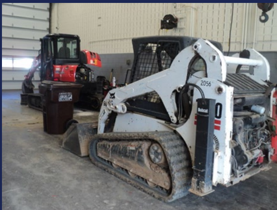
Off Road / Construction