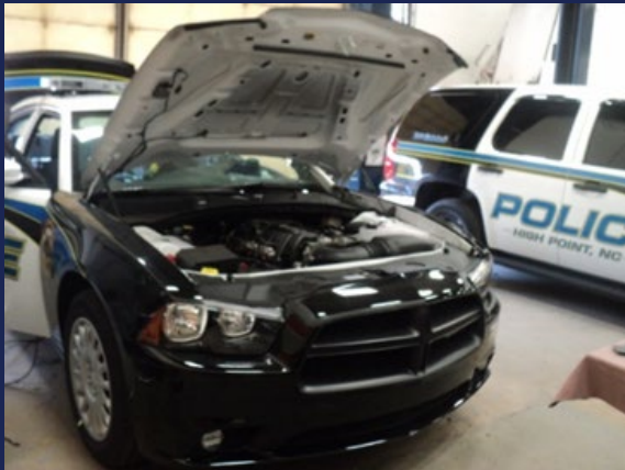
Full Police Equipment Installation