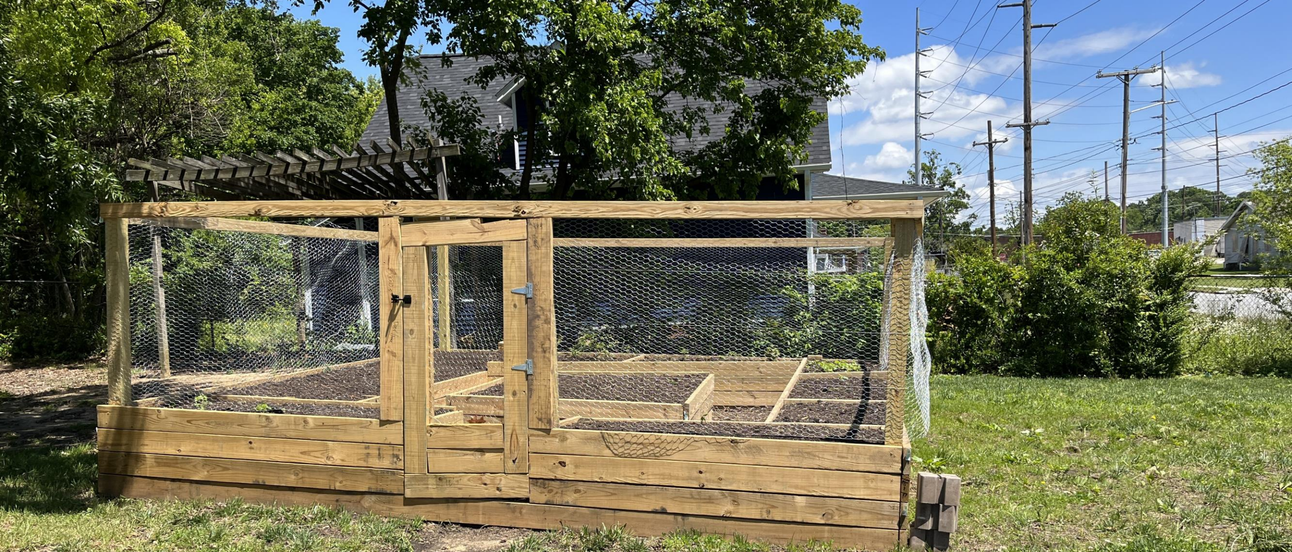
Village Life Legacy Gardens