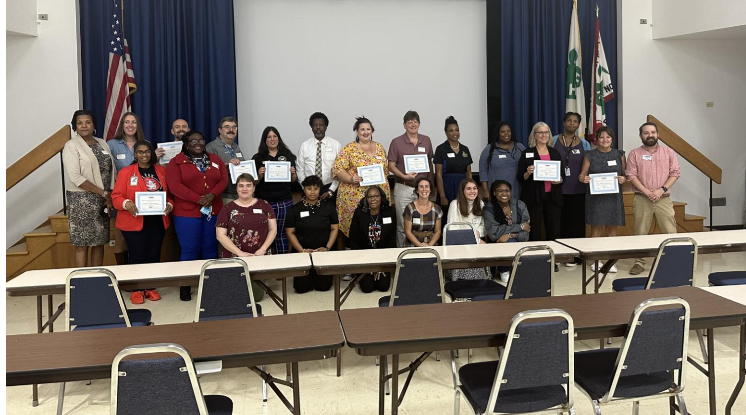
Micro-Grants Awards Reception: • Fairview Elementary • Oak Hill Elementary • High Point Friends School