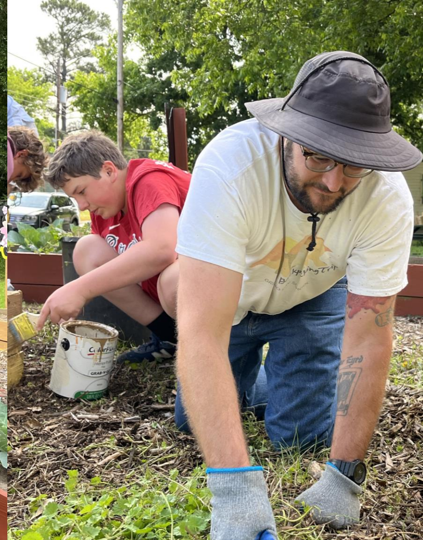
Greensboro Day School Service Day @ Burns Hill Community Gardens