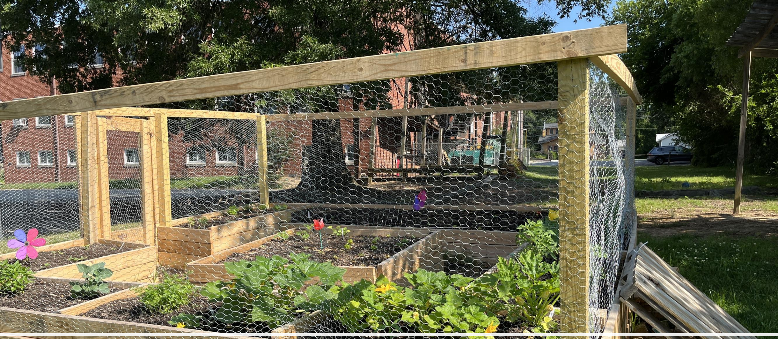
Village Life Legacy Gardens