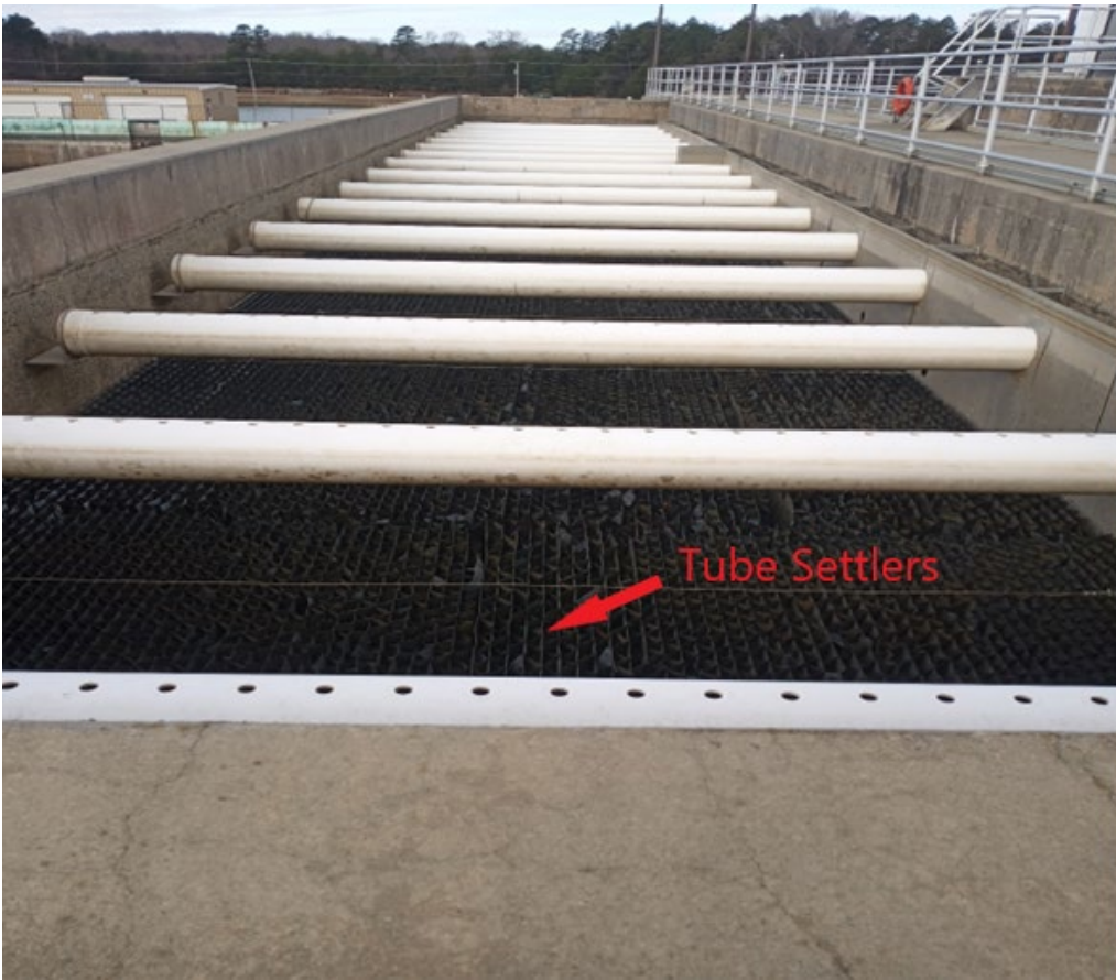
Tube Settlers in the Super Pulsator at the Ward WTP