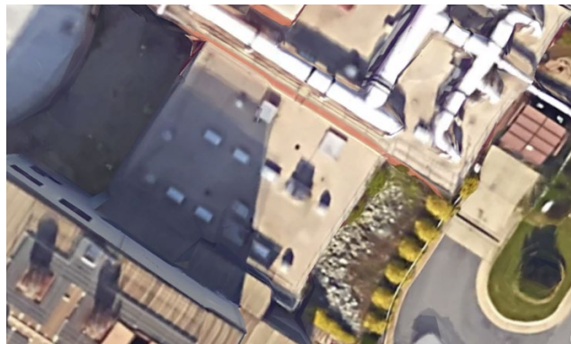
Aerial view of the solids building roof