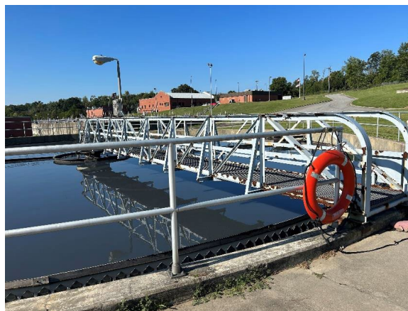
Example of a Primary Clarifier Bridge

RECOMMENDATION/ACTION REQUESTED: The Public Services Department recommends approval of the contract, and that the appropriate City Official(s) be authorized to execute all necessary documents to award the project to Jimmy R. Lynch and Sons Inc. in the amount of $536,000.