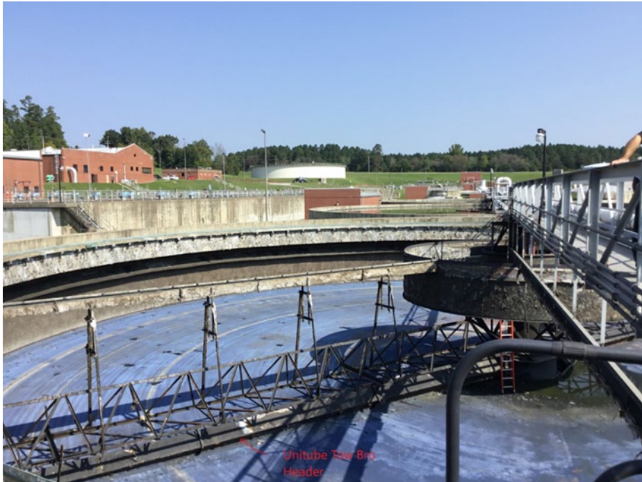
View of a drained final clarifier