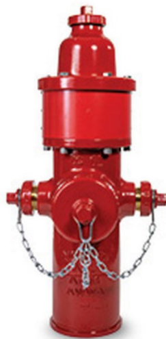
Example of a fire hydrant with an i-Hydrant Retrofit Kit

RECOMMENDATION/ACTION REQUESTED: Public Services is recommending that Kennedy Valve be approved as a sole source vendor for the purchase of the i-Hydrants for $109,033.46 and authorize the appropriate City Official(s) to execute all necessary documents.