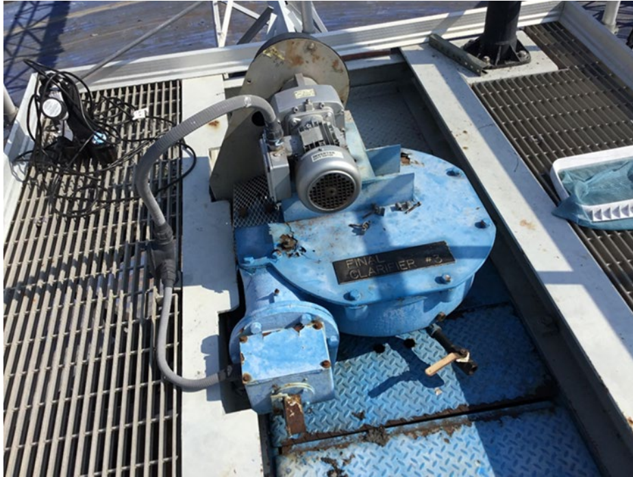
Top view of an existing drive unit.