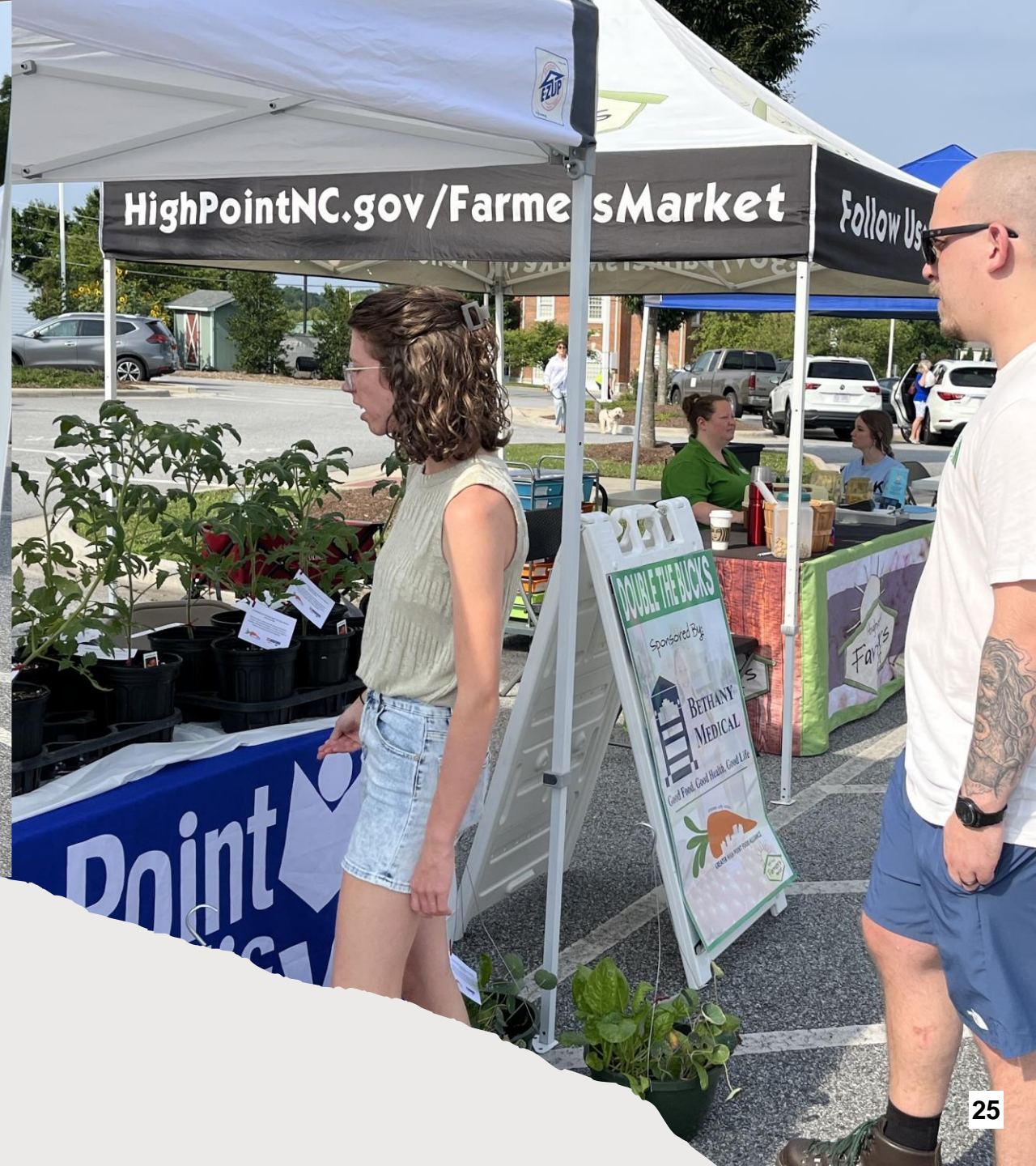
Urban Agriculture Committee Free Plant Giveaway