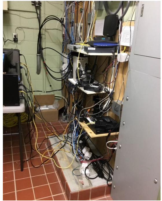
Outdated SCADA computers and communication connections