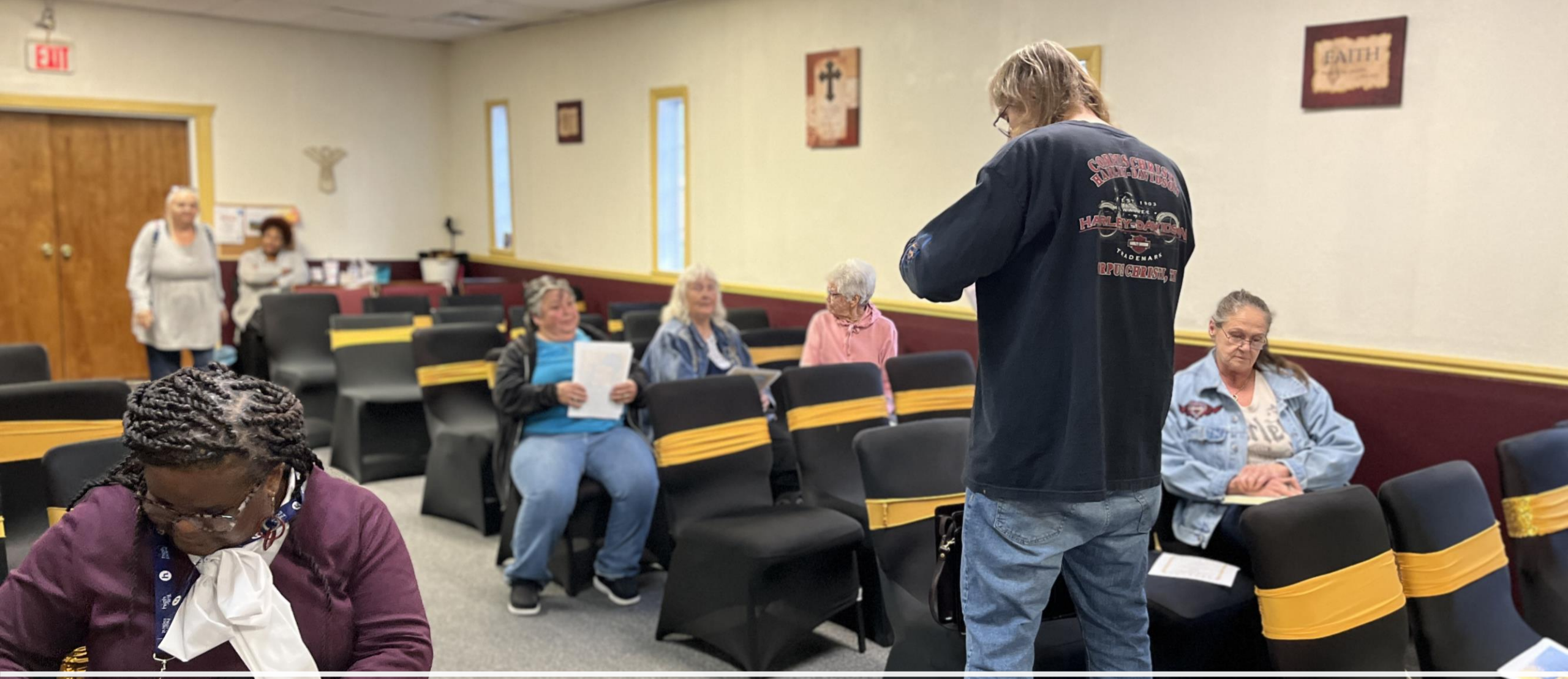
Highland Mills Neighborhood Assoc. Meeting