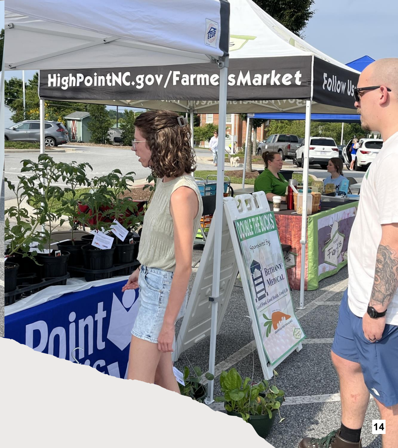
Urban Agriculture Committee Free Plant Giveaway