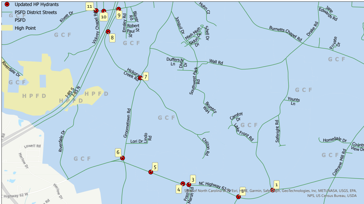
Exhibit G: Fire Hydrant Location Map