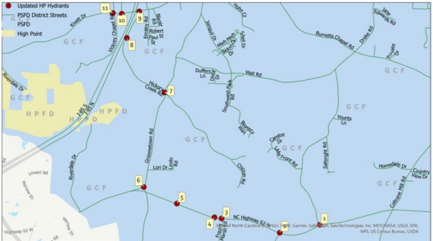
Exhibit G: Fire Hydrant Location Map