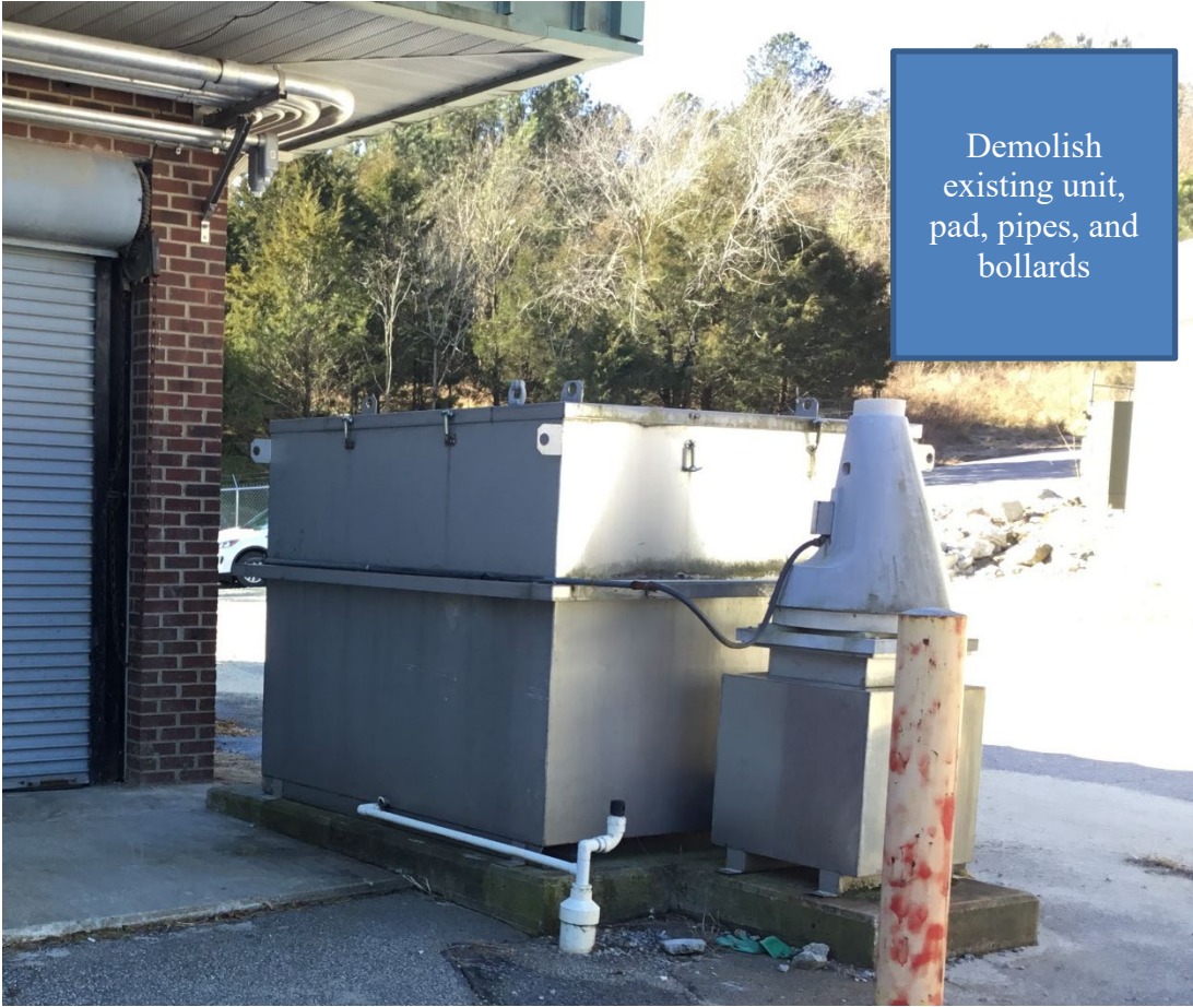
Existing non-functional Odor control unit