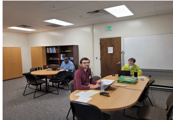
Volunteers @ GTCC Jamestown