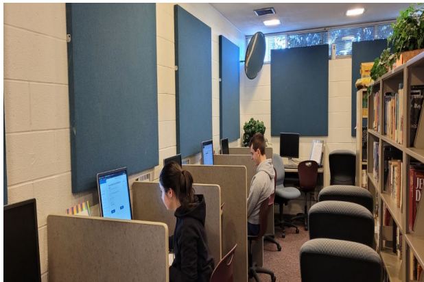
Volunteers @ CNDD