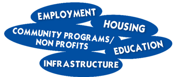
High Point American Rescue Plan Funds

The below chart shows the total dollars committed by the Mayor and City Council to date.