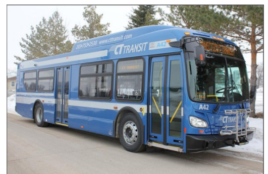
Figure 1: Picture of Similar Bus to be delivered

Staff recommends awarding New Flyer Industries a contract for the purchase of 14 buses in the amount of $6,862,109.73.