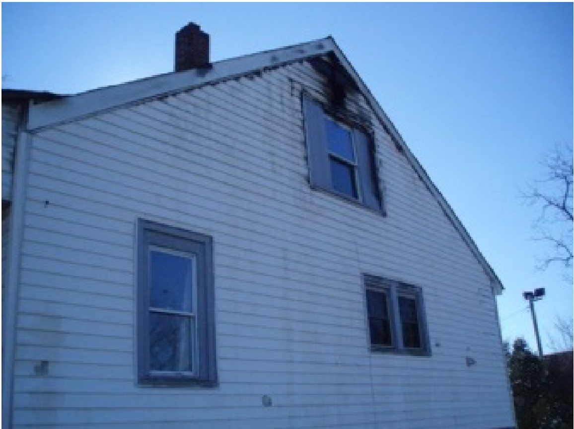
618 Cable Street