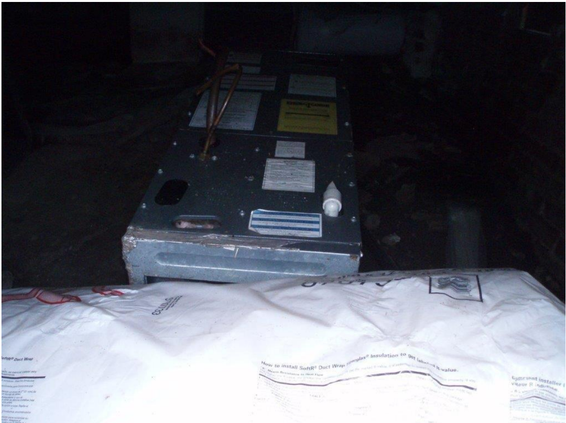
606 Stone Place