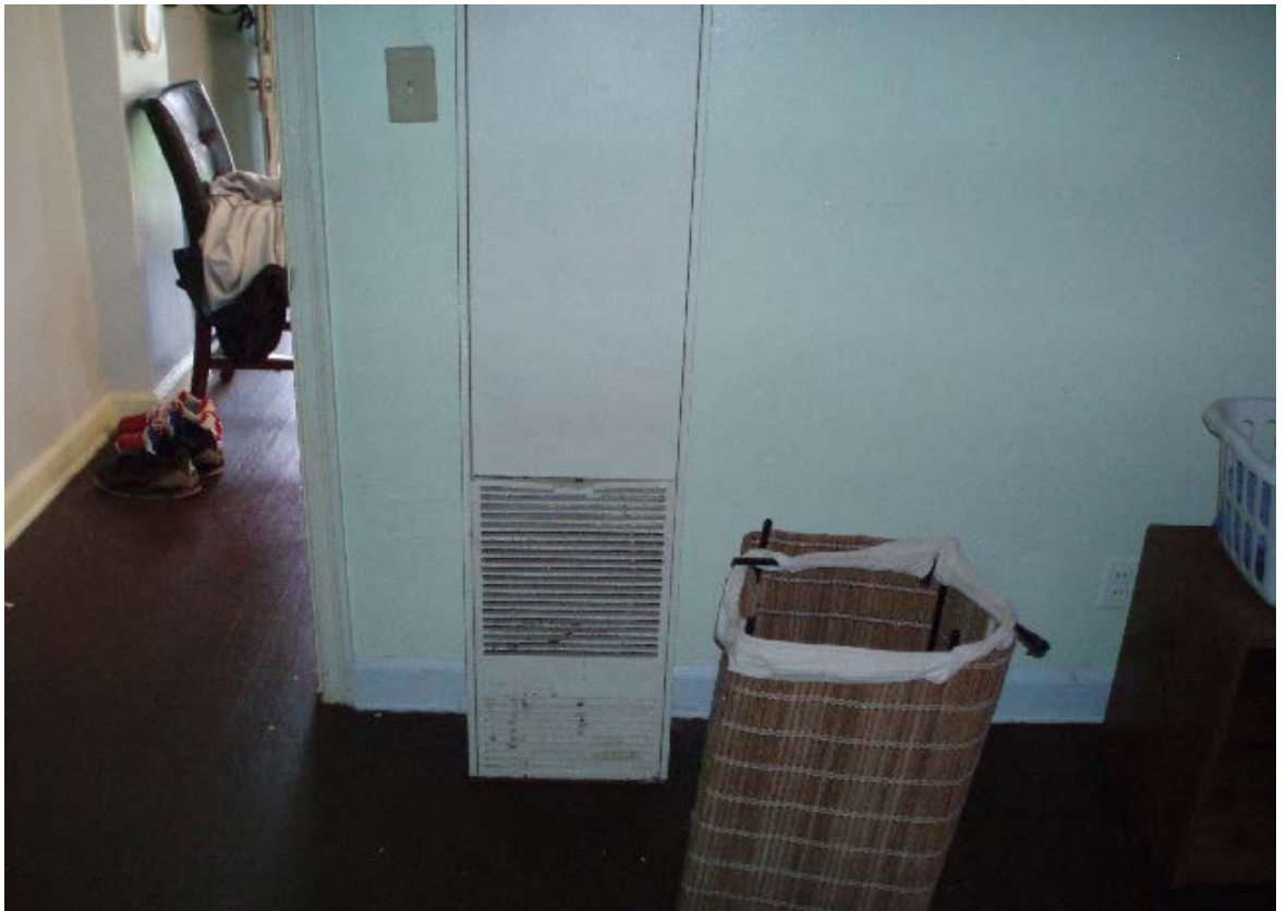
315 A Kearns Avenue