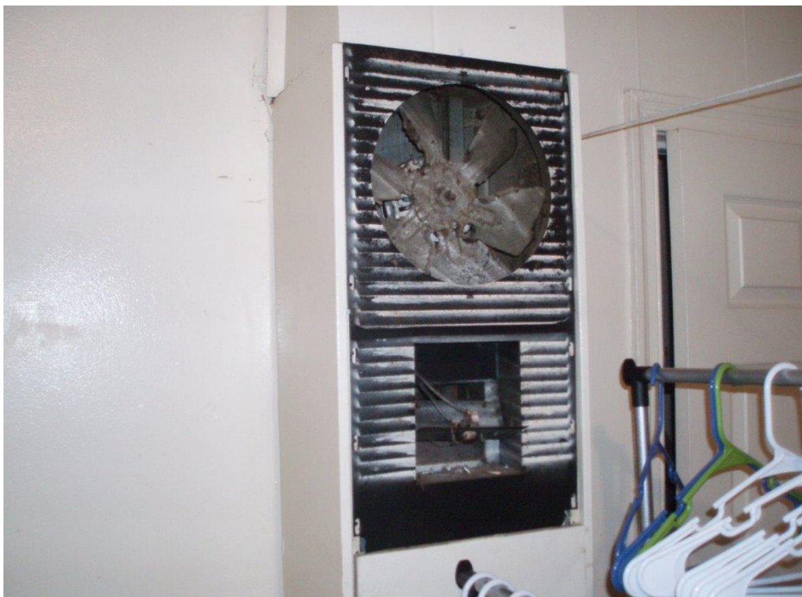
315 B Kearns Avenue