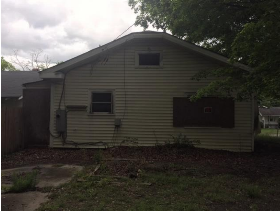
1110 Blain Street – Rear of house 5-6-16