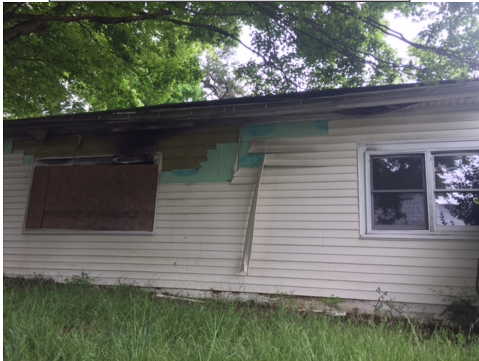
Side of house 5-6-16