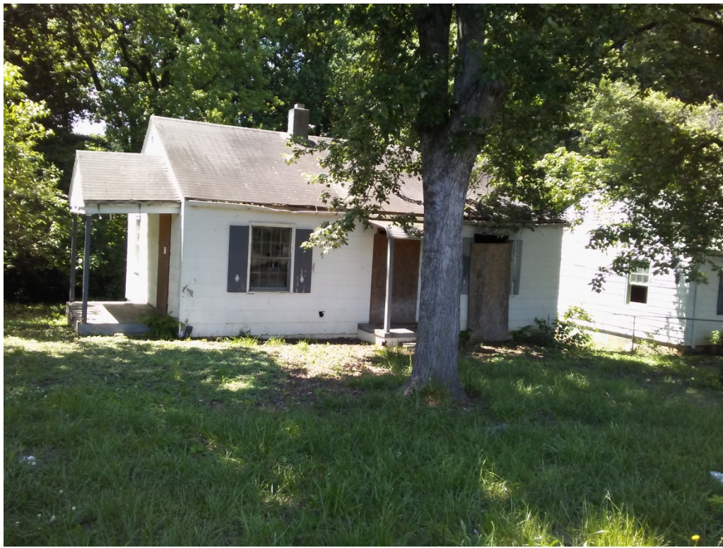
1600 Valley Ridge Dr. Exterior Pictures Taken 5-24-2016