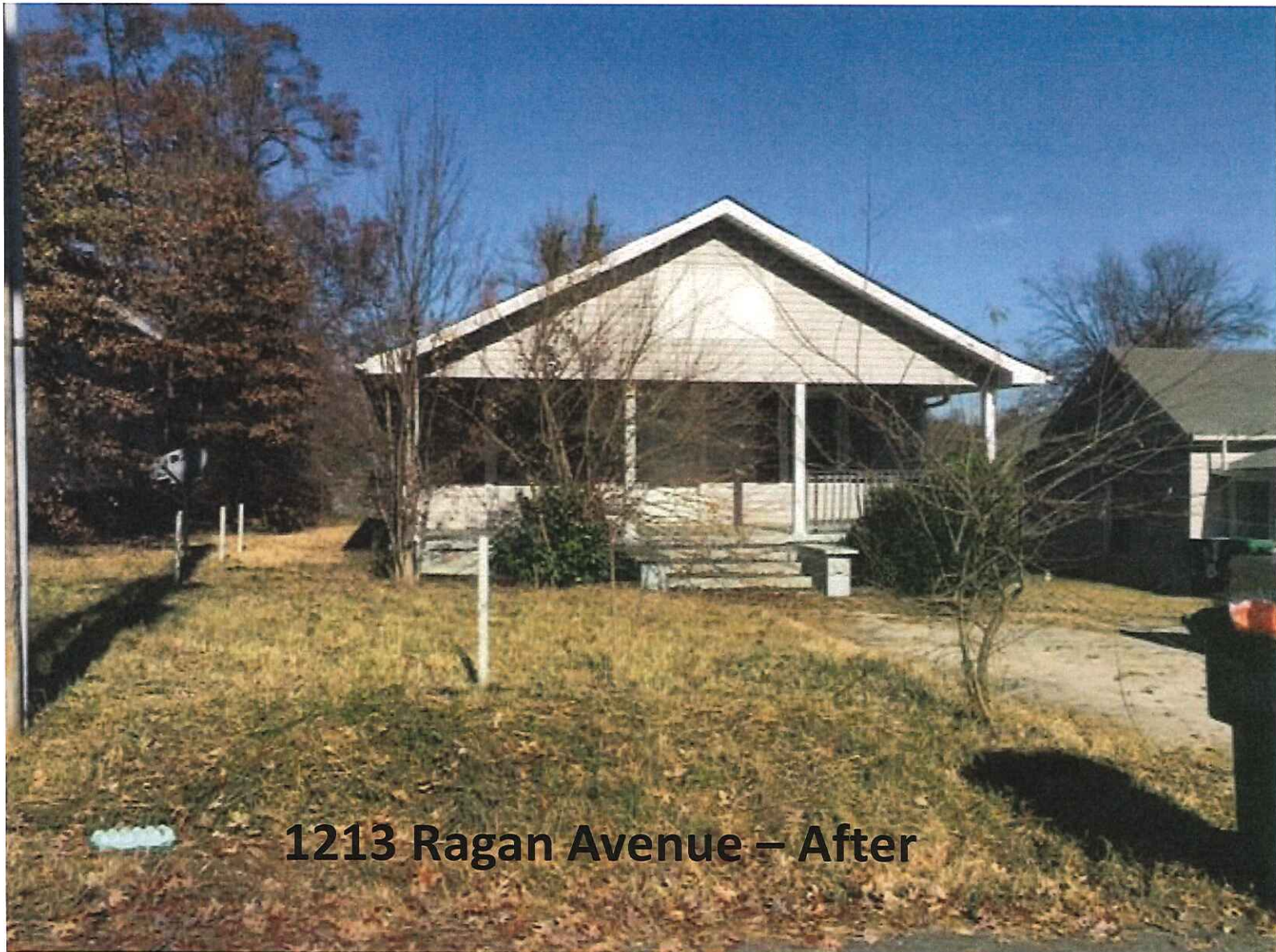
1213 Ragan Avenue – After