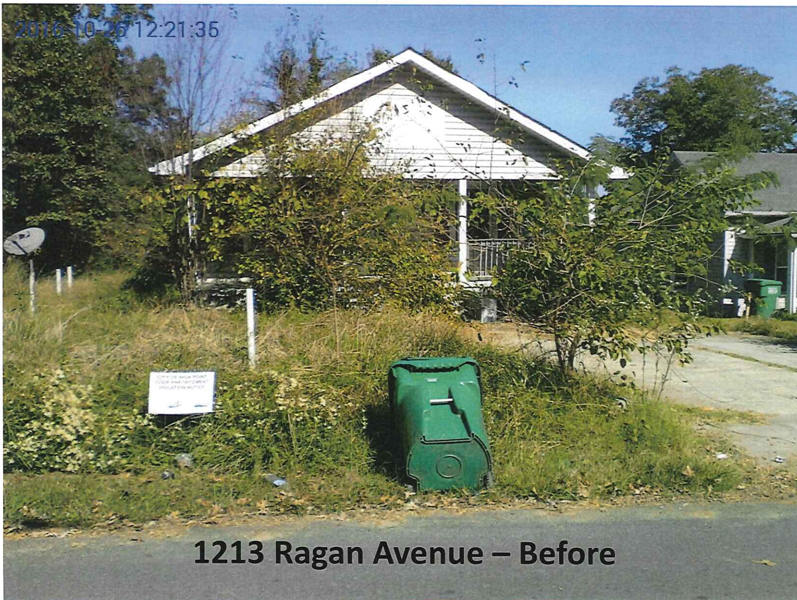
1213 Ragan Avenue – Before