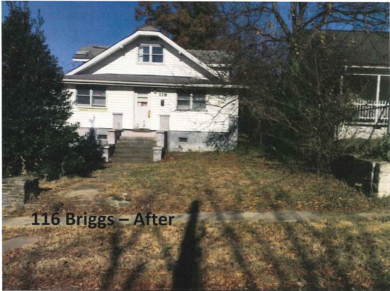
116 Briggs – After