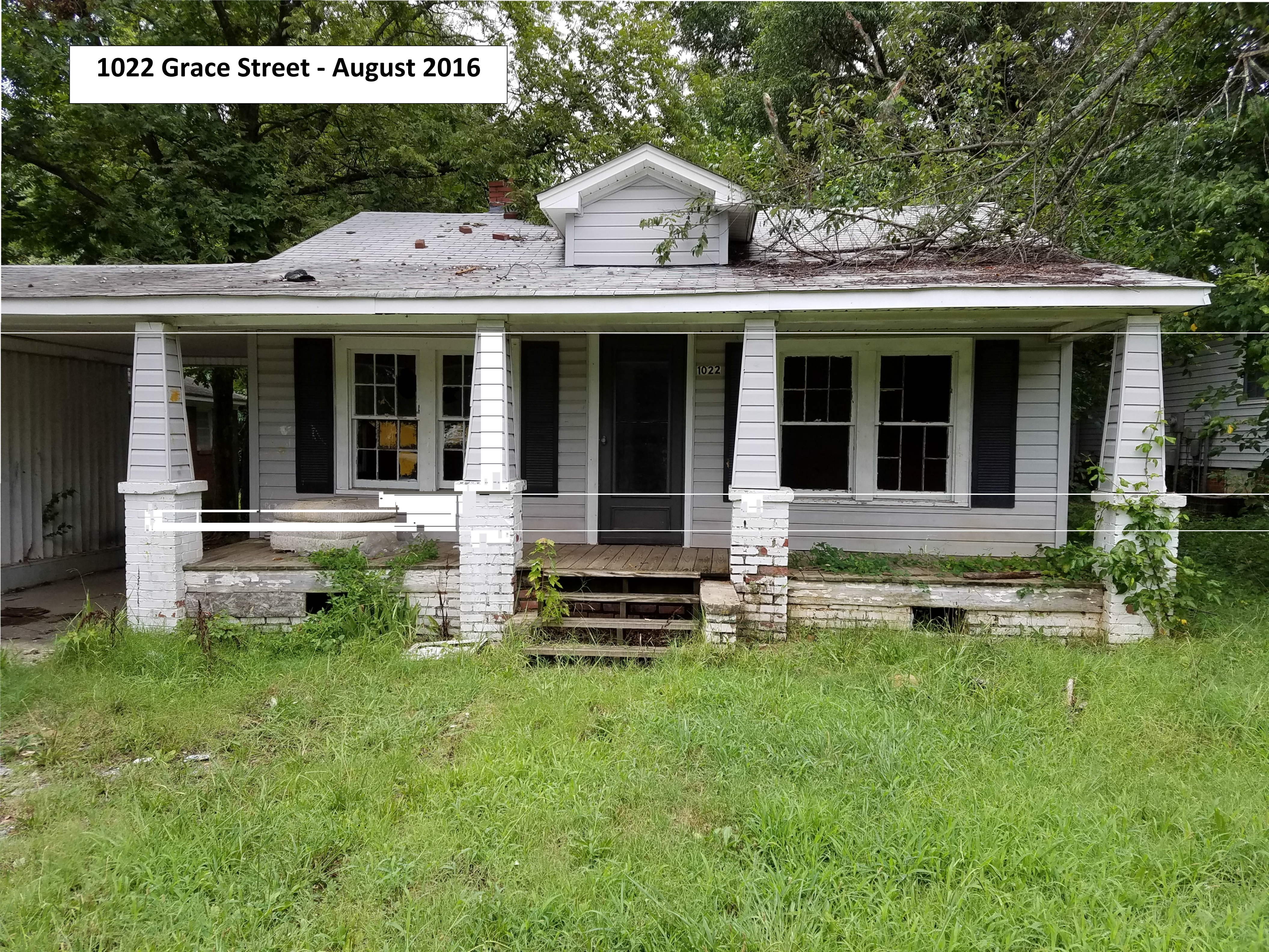
1022 Grace Street - August 2016