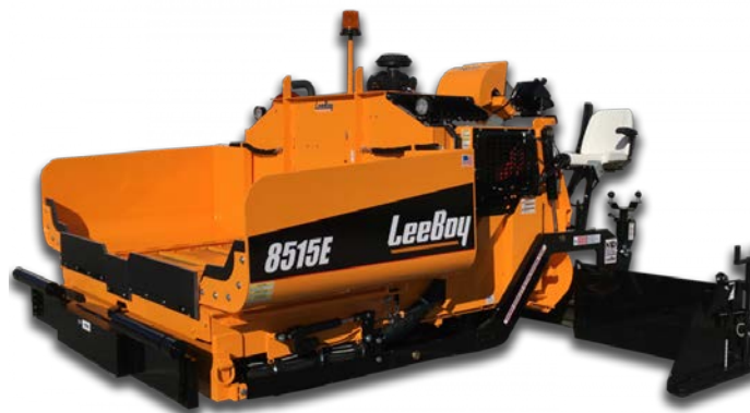
2017 Leeboy 8515E

The Fleet Services Department recommends purchasing a 2017 Leeboy 8515E Paver from our local supplier Carolina Caterpillar. Recommendation also includes declaring the old paver as surplus and disposing through the online auction process.