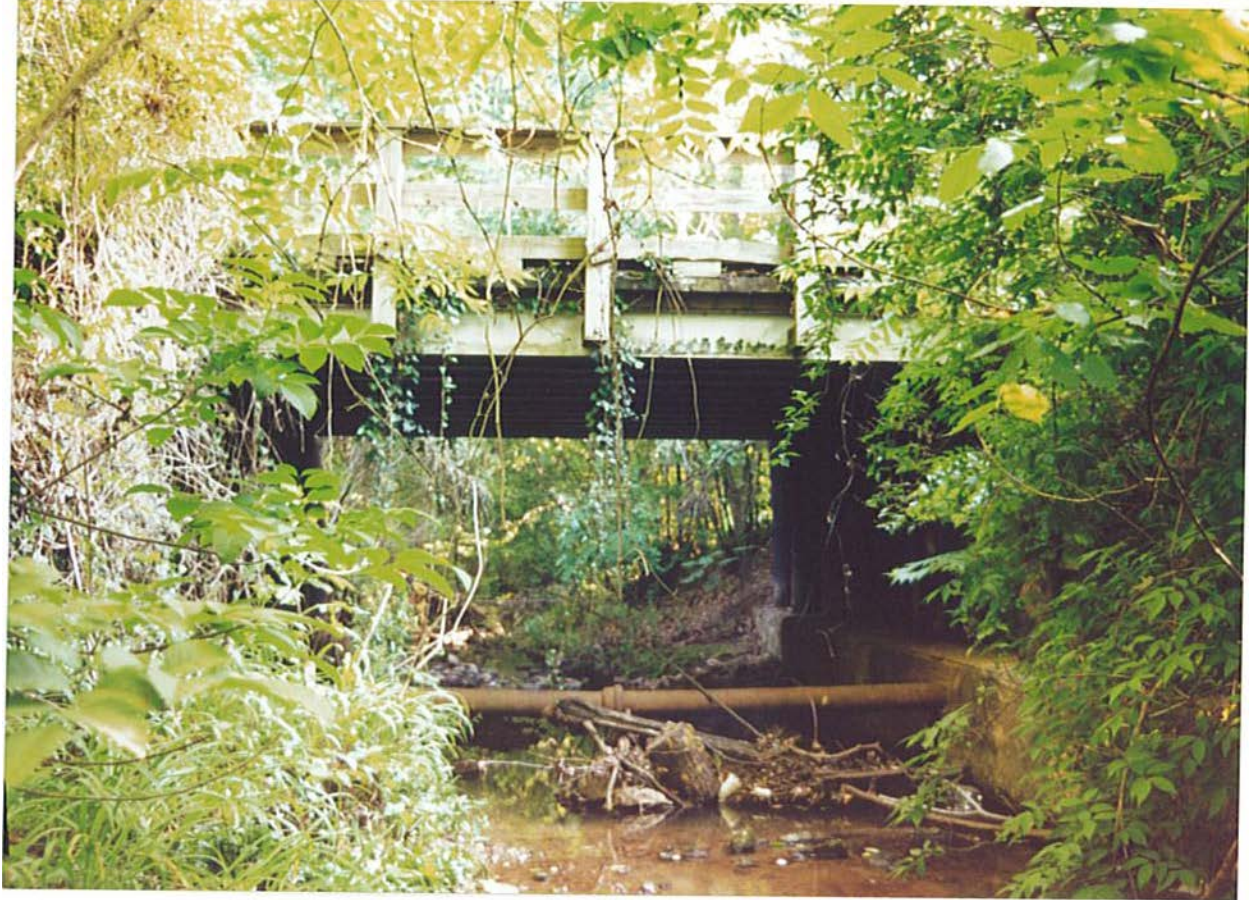
MODEL FARM ROAD BRIDGE