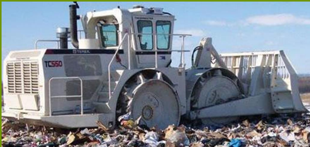
Kersey Valley Landfill (1993)