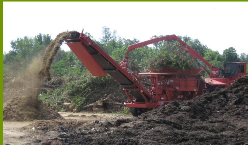
Ingleside Compost Facility (1993)