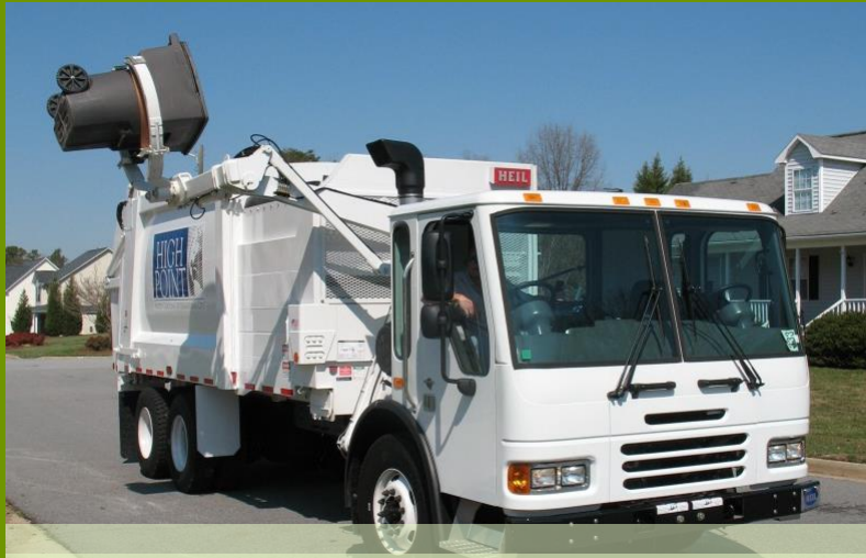
Environmental Services (circa 1920)