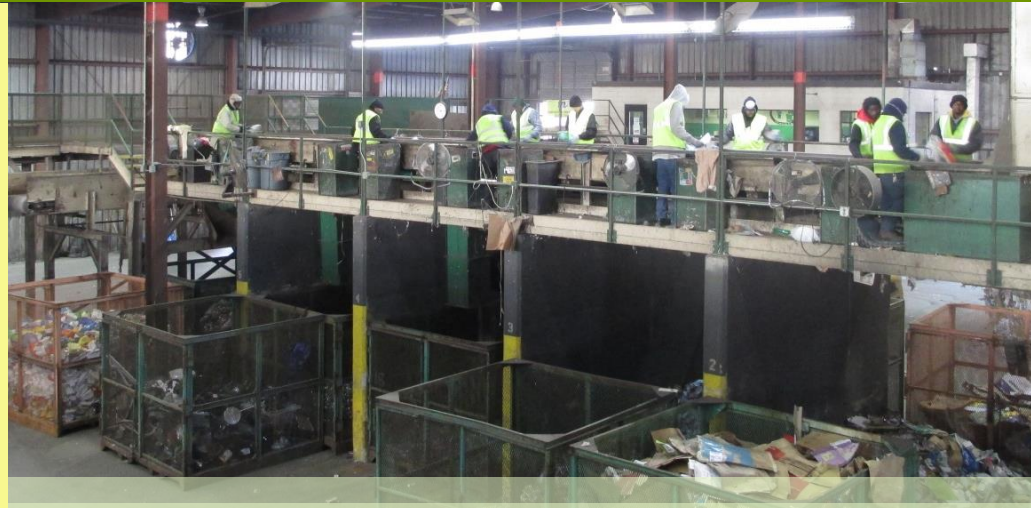
Material Recovery Facility (1990)