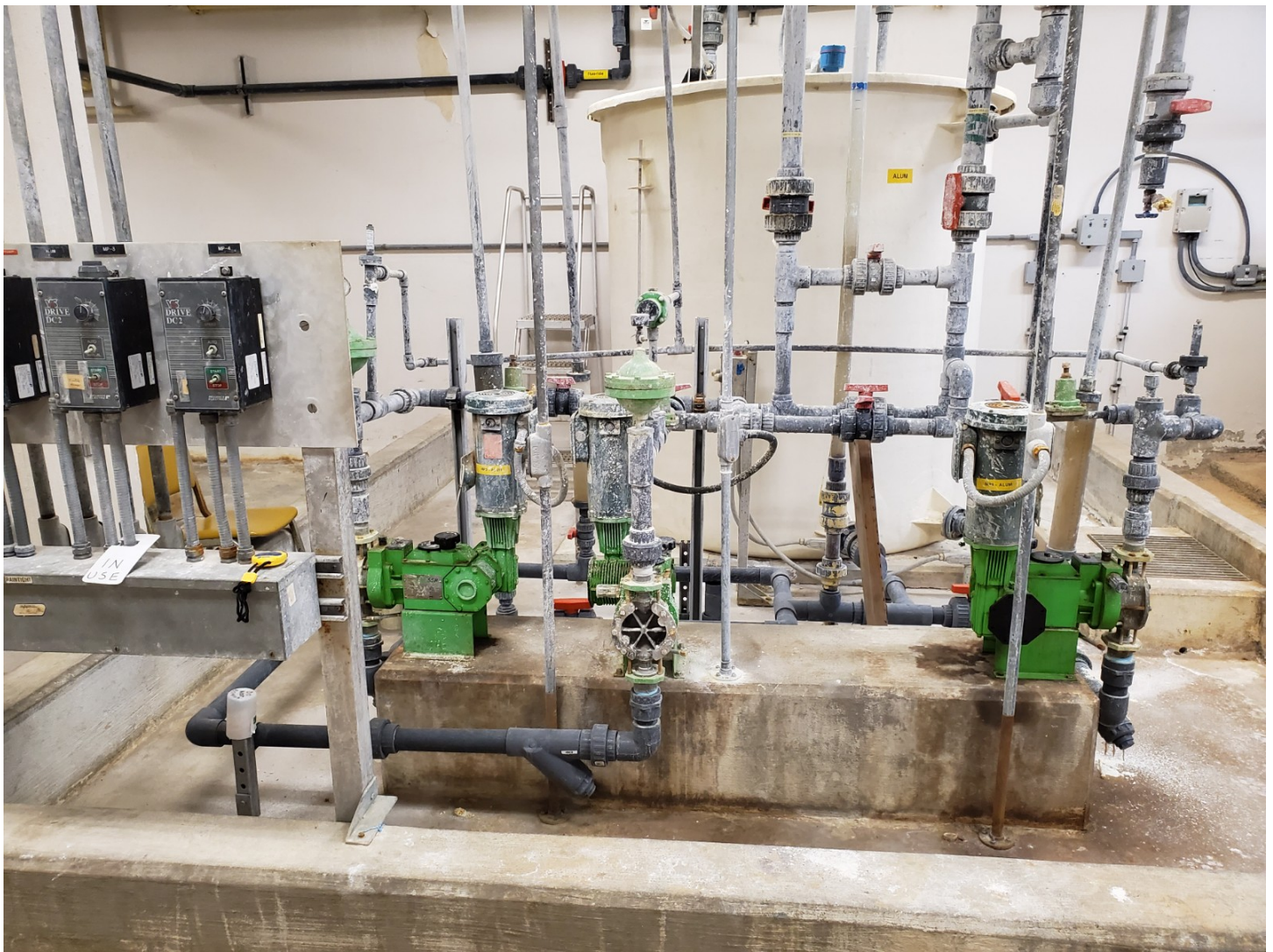
Picture of Existing Alum Feed System