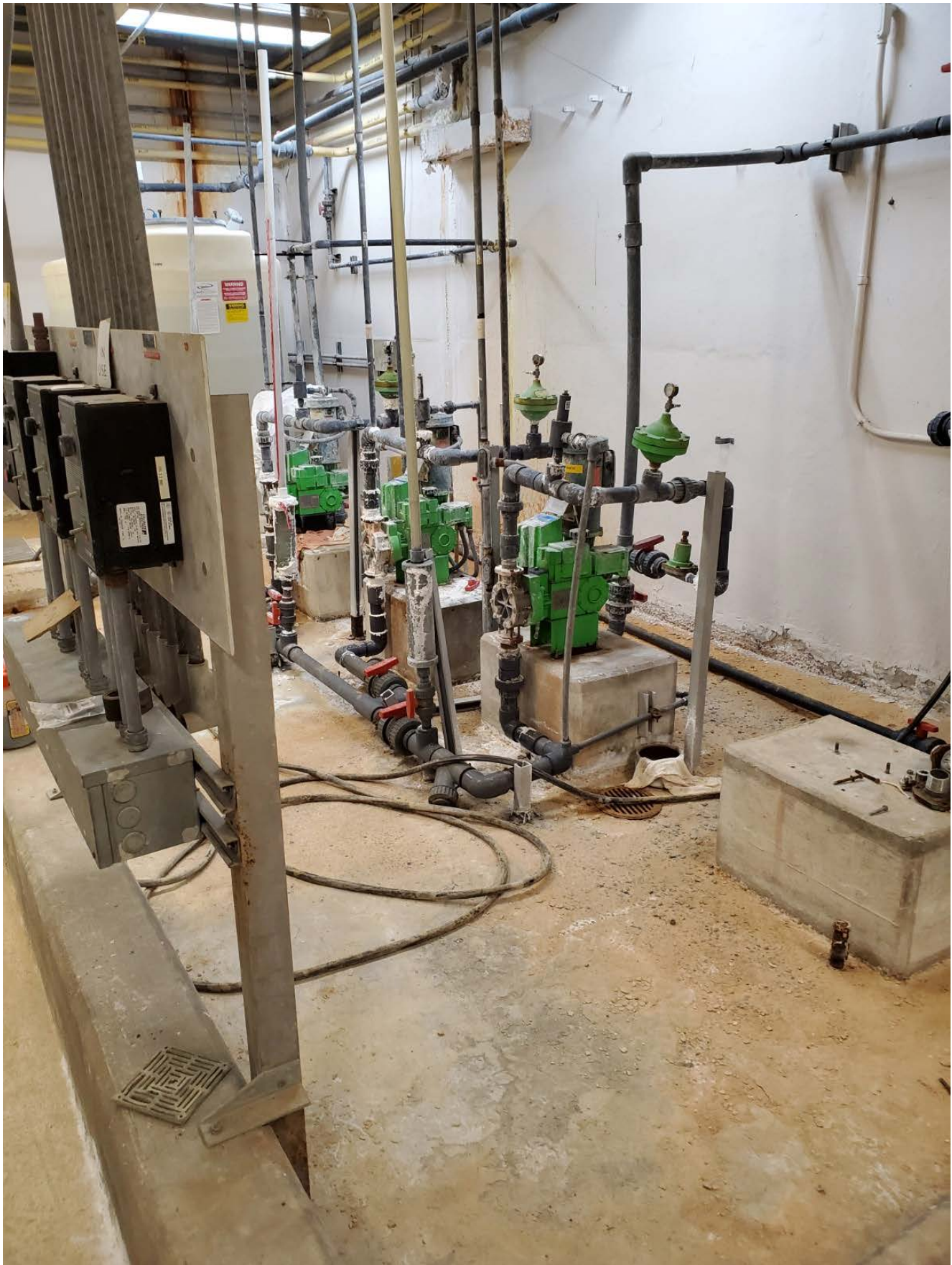
Picture of Existing Caustic Feed System