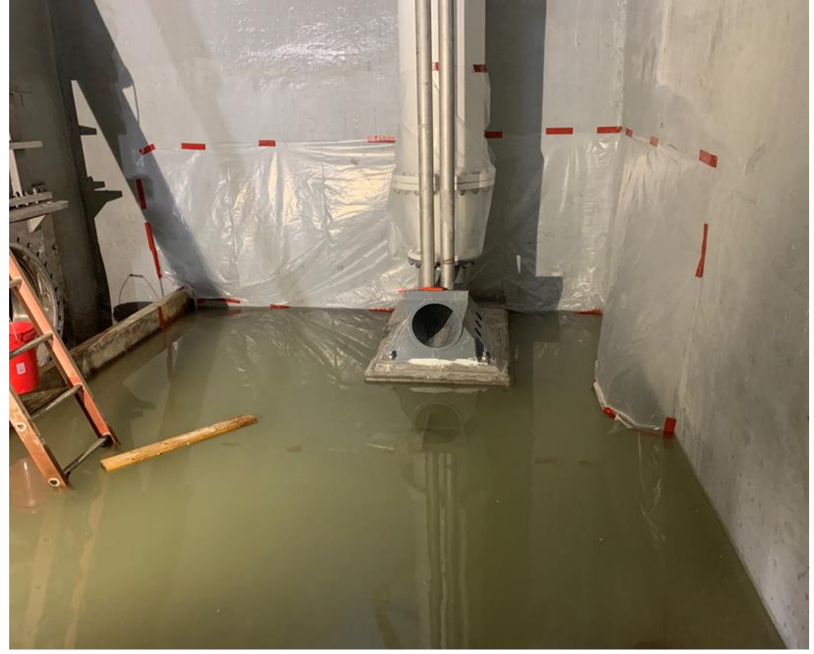
Connection for the new submersible pump

Knife gate valves installed in the wet well