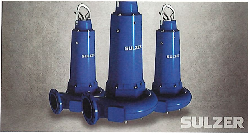
Example of a Sulzer Submersible Pump