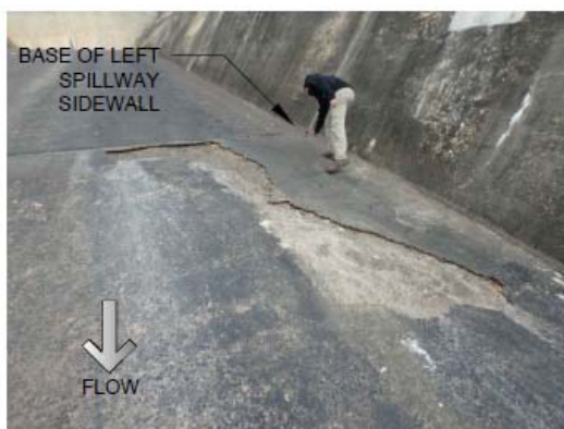
PHOTO: LOOKING UPSTREAM IN SPILLWAY CHUTE.