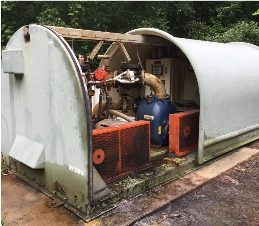
Modify existing Electrical building