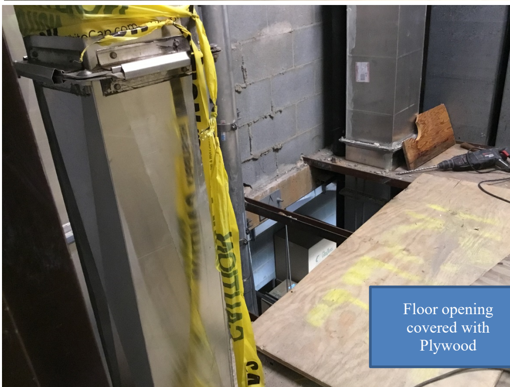
Floor opening covered with Plywood