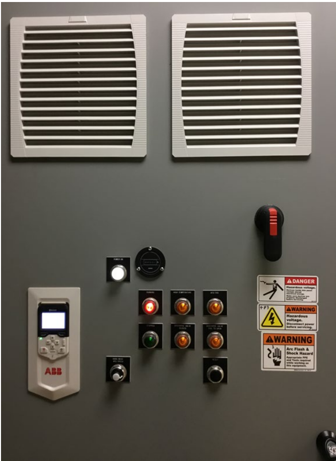
New TP#2 AFD.