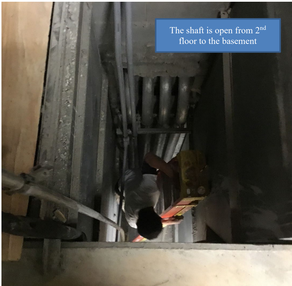
The shaft is open from 2 nd floor to the basement